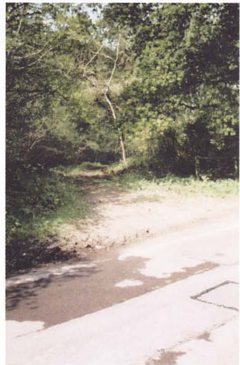
(2) Footpath 15B at its crossing with Castle Hill