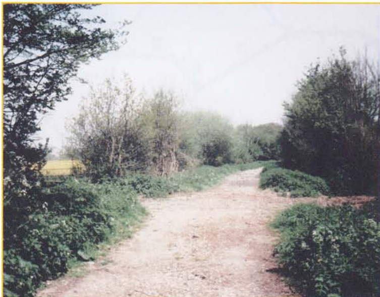
(5) Footpath 29 at the junction with Priest Hill