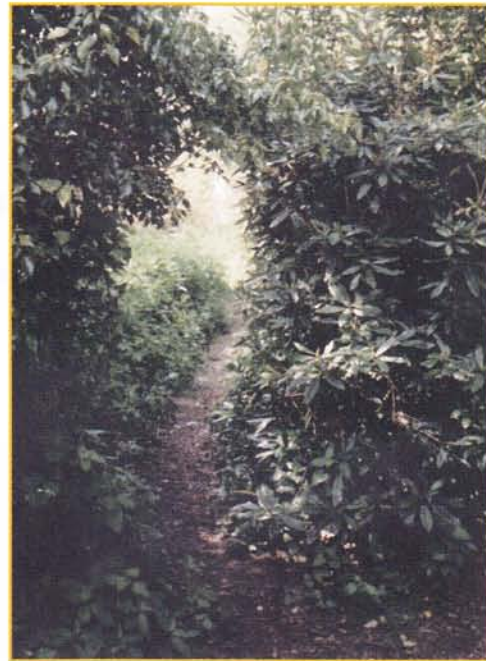
(4) Footpath 12 at the junction with footpath 30