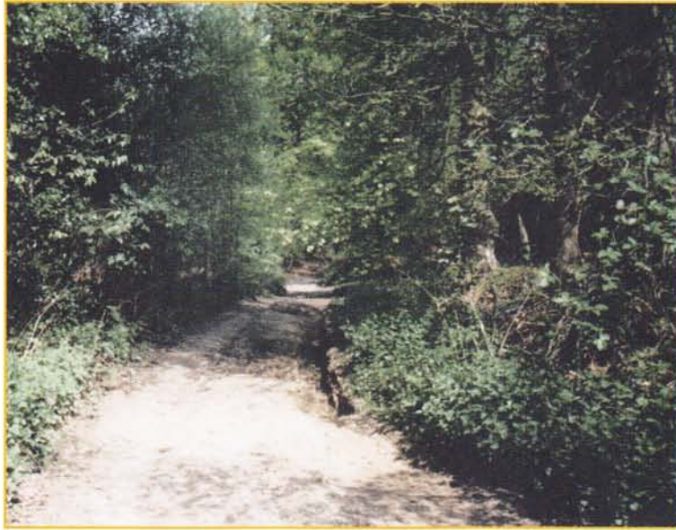
(3) Footpath 30 near the junction with footpath 12