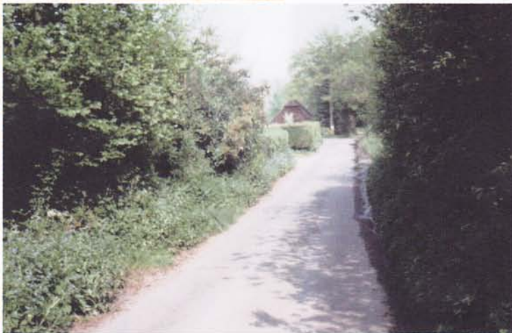
(1) Bunces Shaw