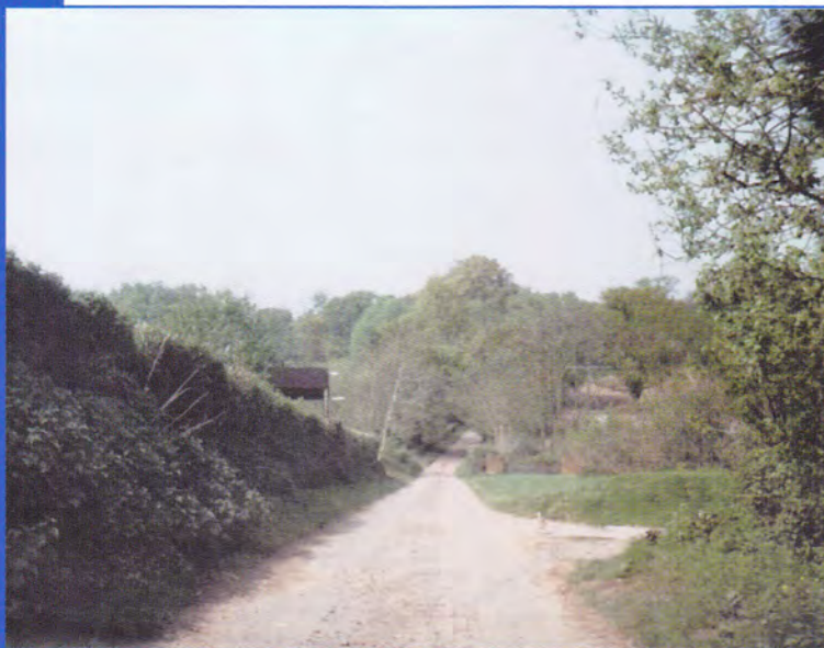
(4) Sandpit Lane Looking towards main road