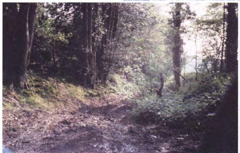
(2) Footpath 32 Looking back towards Ford Lane