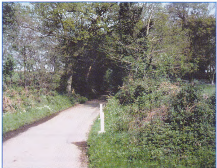
(5) Nutbean Lane Leading into Sandpit Lane