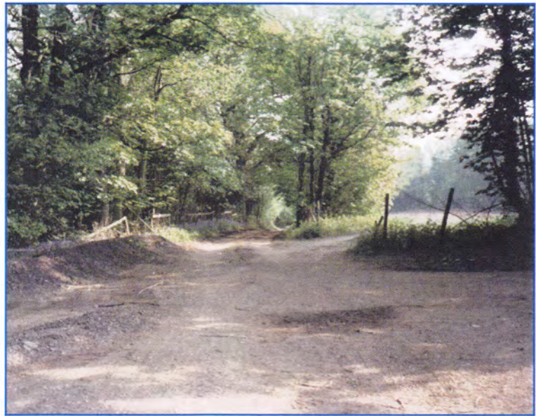
(3) Footpath 33 View from Sandpit lane