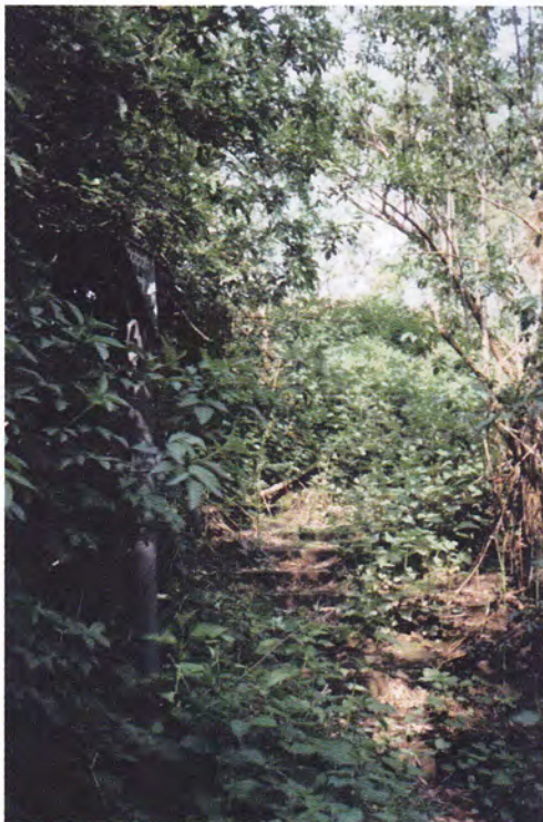
(1) Sandpit Lane Steps up hill - footpath 6