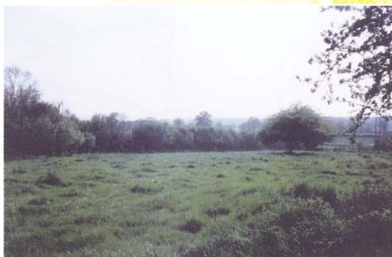
(2) Nutbean Lane View across fields towards the river footpath follows edge of field