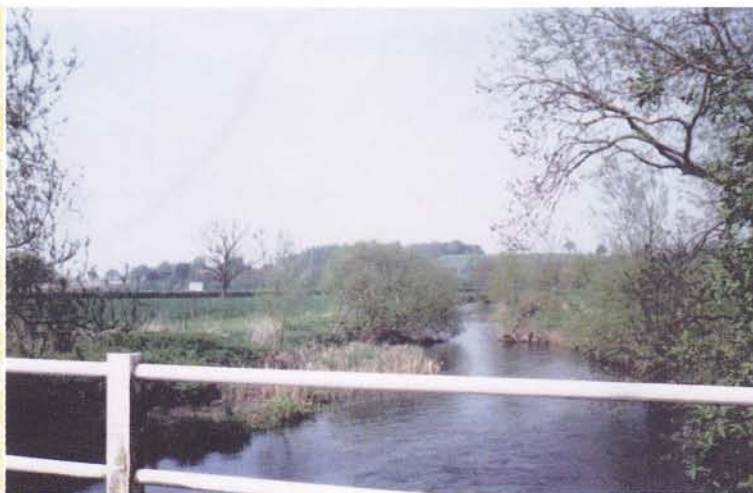
(1) Bridge over River Whitewater