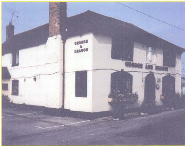
The George and Dragon Public House, Swallowfield (0118 988 4432)

12 noon-3.00pm lunchtime (food orders stop at 2.00pm) 6.00pm-11.00pm evenings (food orders stop at 9.30pm) Monday-Saturday open during the afternoon for drinks only Sunday closed between 3.00pm and 6.00pm