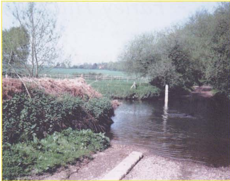
(3) River Blackwater - The ford (Ford Lane)