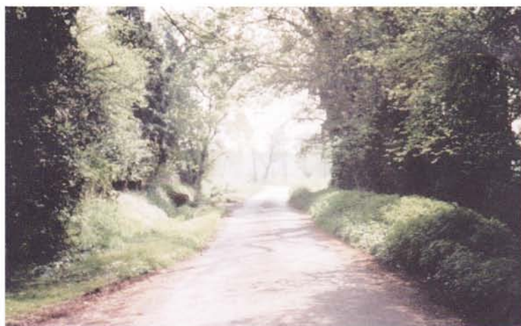
(1) Charlton Lane Looking towards Trowes Lane