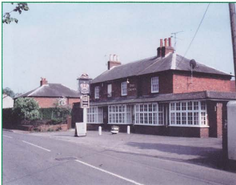
The Crown Public House, Swallowfield (0118 988 3260)