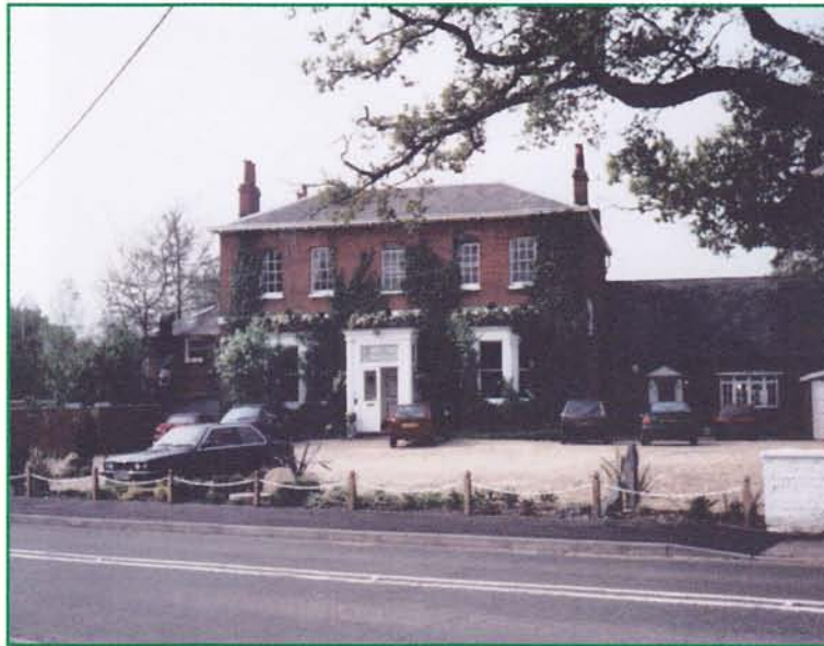
The Mill House Hotel and Restaurant, Swallowfield (0118 988 3124)