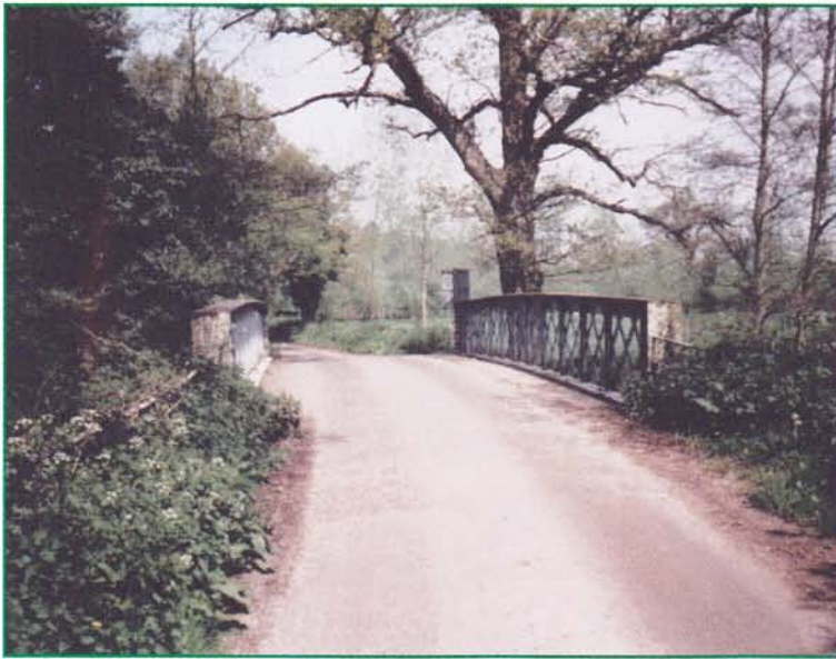
(3) The iron bridge in Kingsbridge Hill