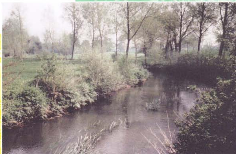
(2) River Loddon, from Kingsbridge View Northwards towards Basingstoke Road