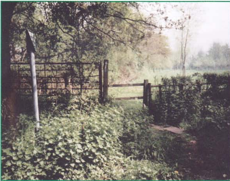
(4) Footpath 19 at the junction with Kingsbridge Hill