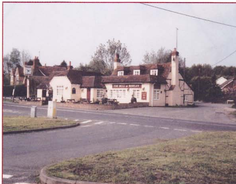
The Bull Public House, Riseley (0118 988 3194)

12 noon-2.30pm lunchtime (food served until 2.00pm)