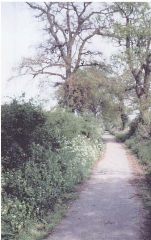
(1) Bull Lane View from junction, looking back towards Riseley