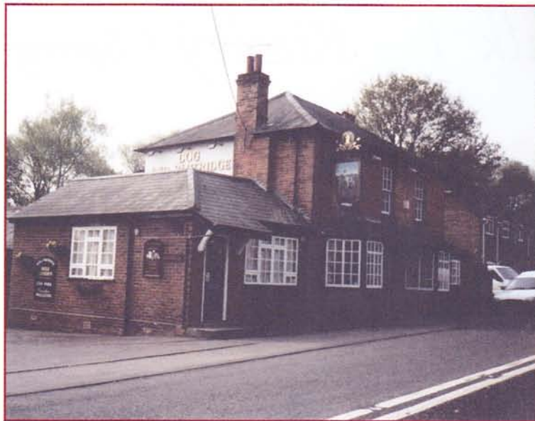
The Dog and Partridge Public House, Riseley (0118 988 3406)