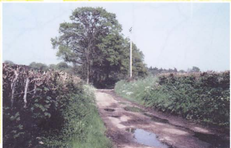
(2) Spring Lane View from junction with Bull Lane